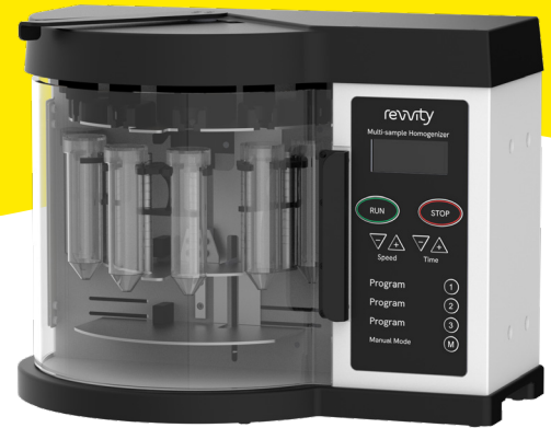
Part number: 06-021