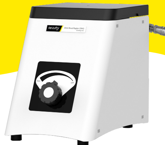
Part number: 19-8005