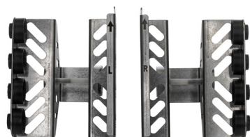
50 mL Tube Holders