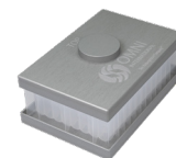
Well Plate Tube Carriage