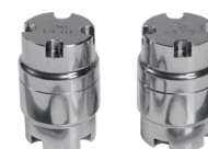
25 mL Milling Jars