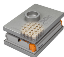
Thermo Scientific Matrix™