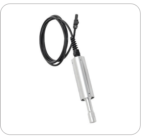
Replacement converter (Part number: 060-03)