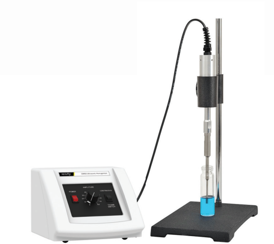
Stand sold separately.

This model is effective for standard cell disruption and many other small volume applications. Probes are available in three different sizes.