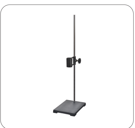
Support stand with converter holder (Part number: 060-10)