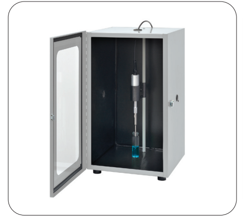
Sound enclosure with converter holder W: 12" (30.5 cm), D: 12" (30.5 cm), H: 20" (50.8 cm) (Part number: 060-12)